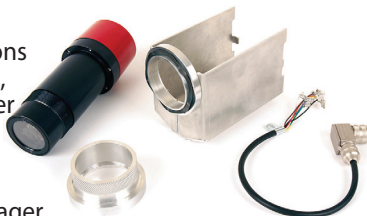
Local user interface

For specific recommendations on the choice of mountings, brackets, cables, or any other accessories, that may suit your specific industry or installation, please contact an AMETEK Land sales manager or representative for further advice before ordering.