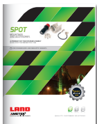
SPOT MOUNTINGS & ACCESSORIES

SEE OUR OTHER LITERATURE FOR SPOT FAMILY PYROMETERS: